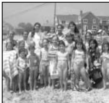
Swimmers wasted no time.