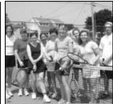
We just joined because of the instructor.