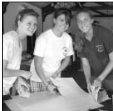
Working hard at registration.