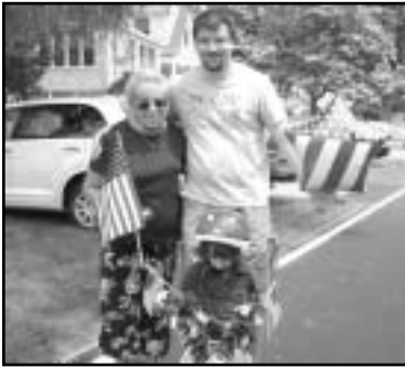
3 generations of Feys and as many Mackeys as we could fit in!