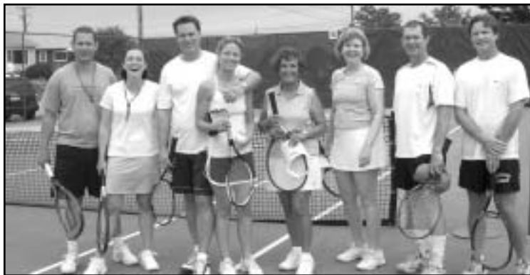
Two good groups of Scramblers filled all four courts.