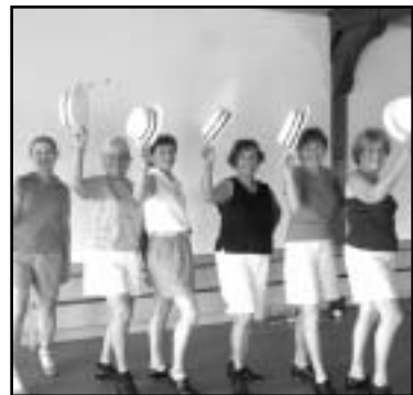
Dancing is hard work, too.