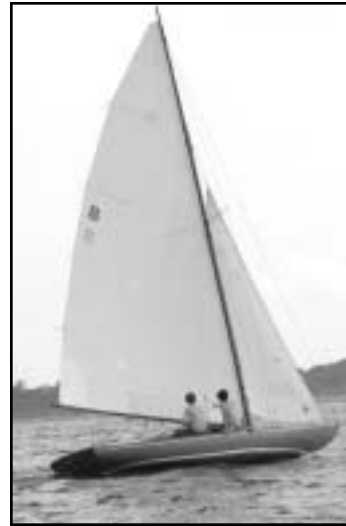
Class A "Cormorant" is for sale 535-9882

and the centerboard trunk quickly enough that the boat didn't capsize, then cruising into a very heavy sea with the boat standing on its "ear" while the more than occasional rogue wave crashed over the bow, re-wetting everything and...then doing it again and again...etc. Then it was spinnaker time and the Dance of the Foredeck. (Good manners prohibits our pursuing that). Suffice to say that, after assessing the damages to boat and bodies, only five players stayed around for the second race, which was won by Petrel, followed by Kittiwake, Skimmer, Swallow and Sanderling. Duck, alone, may be forgiven for heading home early since Darcy and John Watson and crew were hosting the fleet after the race. Ice cream sundaes for the kids and adult beverages for the adults on Duck's Dock. When asked if their early departure was caused by the need for party preparations, Darcy replied, "Oh, no. That was all done ahead. We came back to wrap bandages."