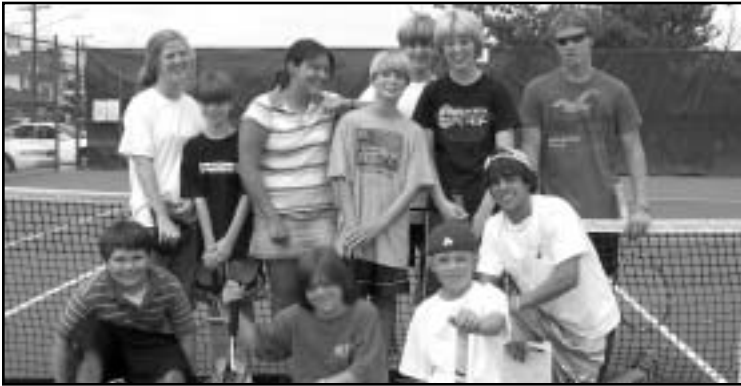
The gang's all here to cheer on the 16 and under Boys' Tennis tournament