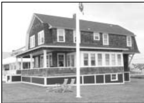
The Viering cottage, chairs, flag-pole and all.